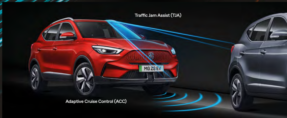
Traffic Jam Assist (TJA)

The MG Pilot suite of high-tech driver assistance technology gives you added confidence on the road. A selection of warning and alert features assist the driver, maintaining safety and simplifying everyday driving.